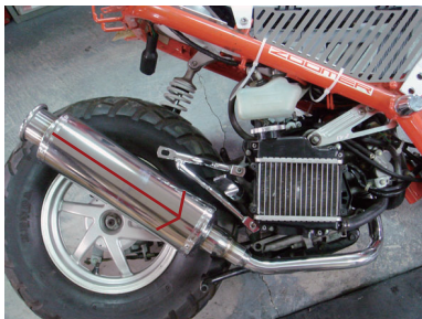
6. Install end pipe into front pipe.