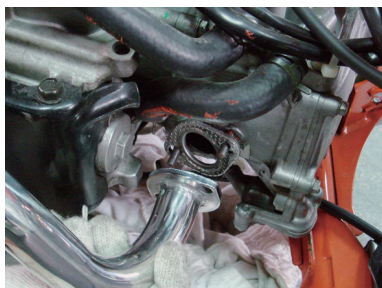
3. Install the front pipe.