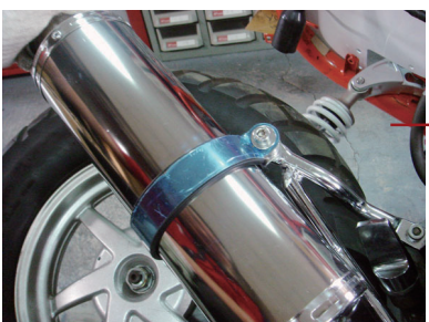
7. Screw on ring with hand.