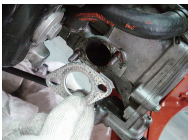
2. Put the new included gasket on the cylinder studs.