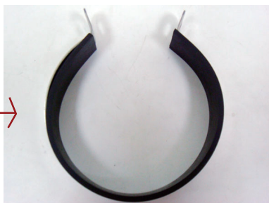
1. Put the rubber ring into ring.