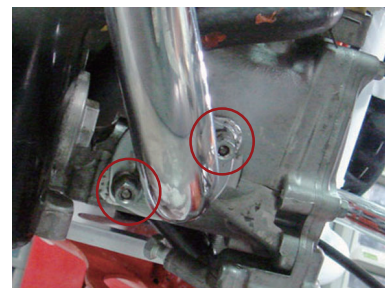
4. Screw on the manifold nuts with hand.