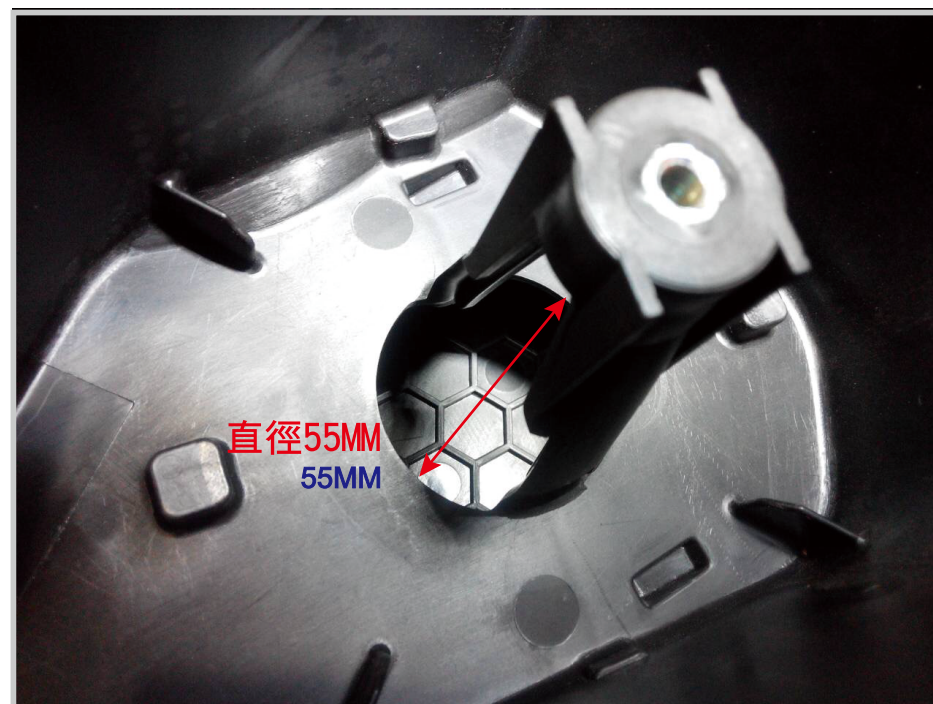
(圖二) (AS PHOTO 2)

2. RECOMMEND TO BORE UP THE ROUND HOLE DIAMETER TO 55MM (AS PHOTO 2) BEFORE INSTALLING THE CLEANER. IT WORKS MORE EFFECTIVELY.