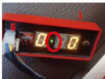
9. CONNECT NCY WIRE TO ADJUSTER AND TURN ON SWITCH TO CHECK WHETHER ADJUSTER SHOWS SIGN OR NOT.