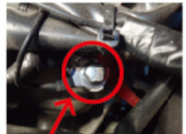
8. LOCK GROUND WIRE INTO ENGINE BODY.