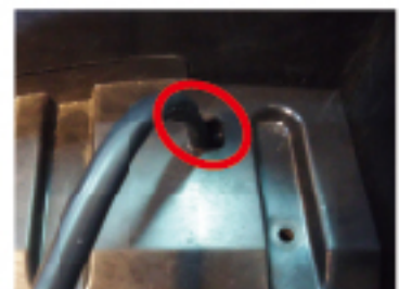
11. PIERCE A HOLE IN THE LUGGAGE BOX TO MAKE WIRE PASS THROUGH.