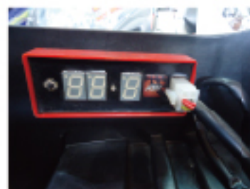
12. USE THE VELCRO TO ATTACH ADJUSTER IN THE LUGGAGE BOX. THIS ADJUSTER IS NOT WATERPROOF.