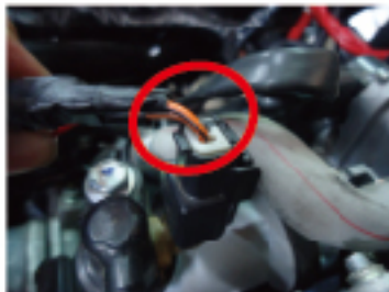
2. CUT INJECTOR WIRE SET.