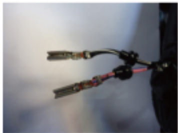
5. FASTEN TWO WIRES AS ABOVE PHOTO.