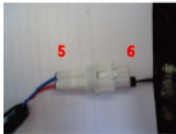
7. INSERT THE WIRE (+) INTO NO.6 CONNECTOR [CONNECT TO NO.5 CONNECTOR (RED)].