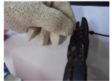
4. USE PLIERS TO FASTEN PIN.