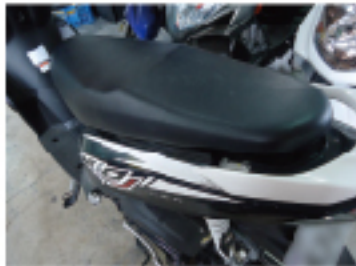
1. REMOVE LUGGAGE BOX.