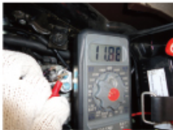
6. TURN ON THE SWITCH AND CHECK WHICH WIRE IS (+).