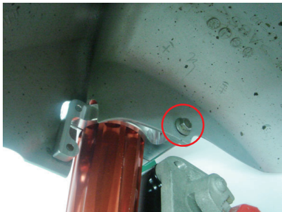
4. USE ORIGINAL FRONT FENDER SCREW TO LOCK FRONT FENDER AND FRONT FENDER RING. . AND THEN LOCK STEP NO. 2