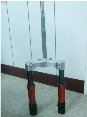
1. FIRST INSTALL ALUMINUM STEERING STEM AND ALUMINUM FRONT FORKS 41MM