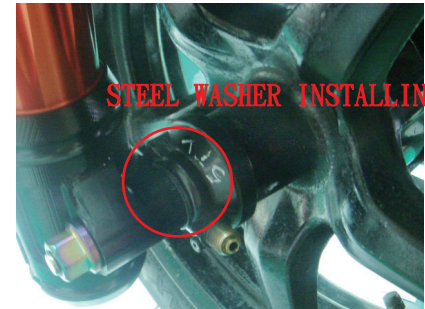
5. INSTALL ALUMINUM FRONT FORKS 41MM, EP TITANIUM FRONT RIM AXLE, AND STEEL WASHER ON RIM