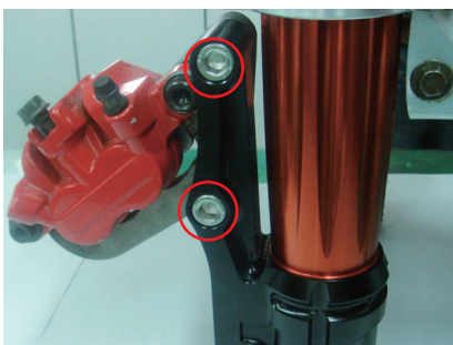
6. CHANGE ORIGINAL CALIPER SCREW TO NCY CALIPER SCREW