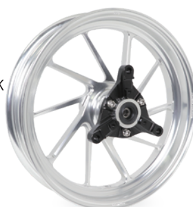
六代勁戰 N-20 鍛造鋁鋼圈 A款 前碟 N-20 FORGED ALUMINUM RIM/ FRONT DISK / A TYPE FOR CYGNUS GRYPHUS 125 ITEM NO : 999F11B8RN20AF...