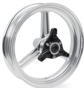
六代勁戰 ES-A12 鍛造鋁鋼圈 前碟 ES-A12 FORGED ALUMINUM RIM/ FRONT DISK FOR CYGNUS GRYPHUS 125 ITEM NO : 999F11B8RESA12F...