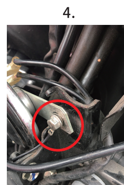
4. 鎖附完成 Finish installing.