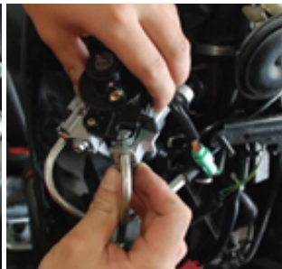
步驟6: 安裝行李箱及油箱蓋鋼索 STEP 6: INSTALL THE STEEL WIRE CONNECTING TO OIL TANK & LUGGAGE BOX.