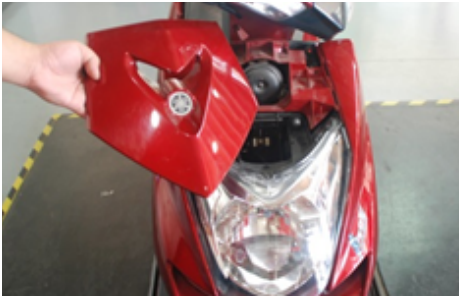
步驟1: 先將小盾拆下 STEP 1: TAKE OFF FRONT COVER.