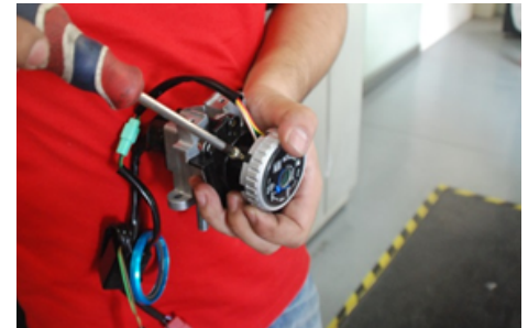
步驟5: 將晶片防盜鎖之面板取下 STEP 5: TAKE OFF IC ANTI-THEFT SWITCH PANEL.