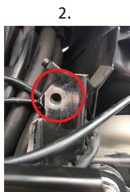
2. 用砂紙磨掉表面烤漆減少絕緣 Use sandpaper to rub the coating surface to decrease insulation.