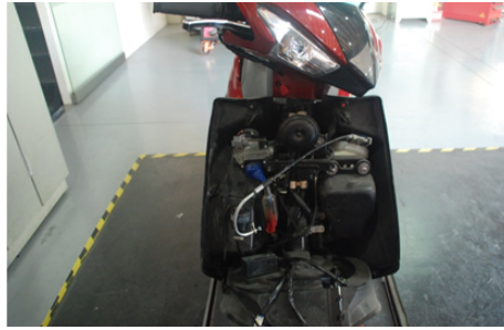
步驟2: 將頭燈及前車殼一同拆下 STEP 2: TAKE OFF HEAD LIGHT & COVER.