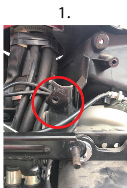
1. 建議接地線鎖附位置 Suggest Ground Wire install place.