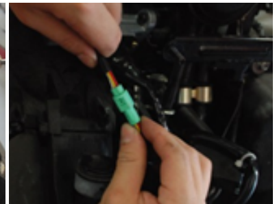
步驟7: 安裝鎖頭座及接上電線，負極與喇叭一起鎖附並套好防水套 (照片上無防水套請依實物為主)

STEP 7: INSTALL SWITCH POST & CONNECT WIRE HARNESS, "-" & HORN CONNECT TOGETHER AND PUT ON WATERPROOF COVER. (PHOTO NO WATERPROOF COVER, REAL PRODUCT W/ WATERPROOF COVER)