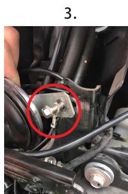
3. 將接地線接頭鎖附在喇叭支架螺絲孔上 Put Ground Wire connector on the screw of horn bracket.