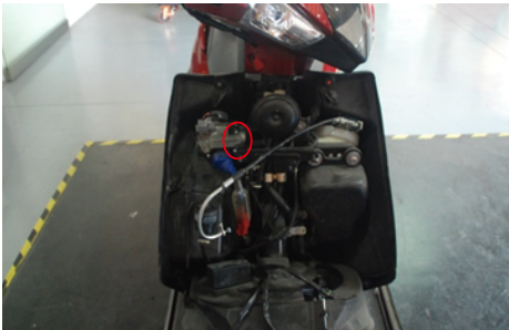
步驟4: 將原廠鎖頭取下並將其電線拔除 STEP 4: TAKE OFF ORIGINAL SWITCH & PULL OUT WIRE HARNESS.

*將紅圈處支螺絲取下即可拆下原廠鎖頭面板 TAKE APART BOLTS (RED CIRCLE) TO TAKE OFF ORIGINAL SWITCH PANEL.