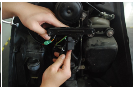
步驟7: 測試功能是否正常，測試完成後固定線組及防盜器本體 (請依照個人喜好固定)

STEP 7: TEST FUNCTION AVAILABLE OR NOT. AFTER TESTING, FIX WIRE HARNESS AND ANTI-THEFT SWITCH. (FIX BY PERSONAL REQUIREMENT)